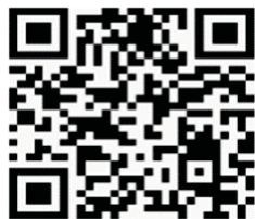
Offertory & Second Collections

Use your phone's camera to conveniently make your donation/ payment via Givebutter, which accepts Venmo, Credit Cards, ApplePay: